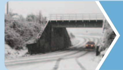
2 | Road alerts