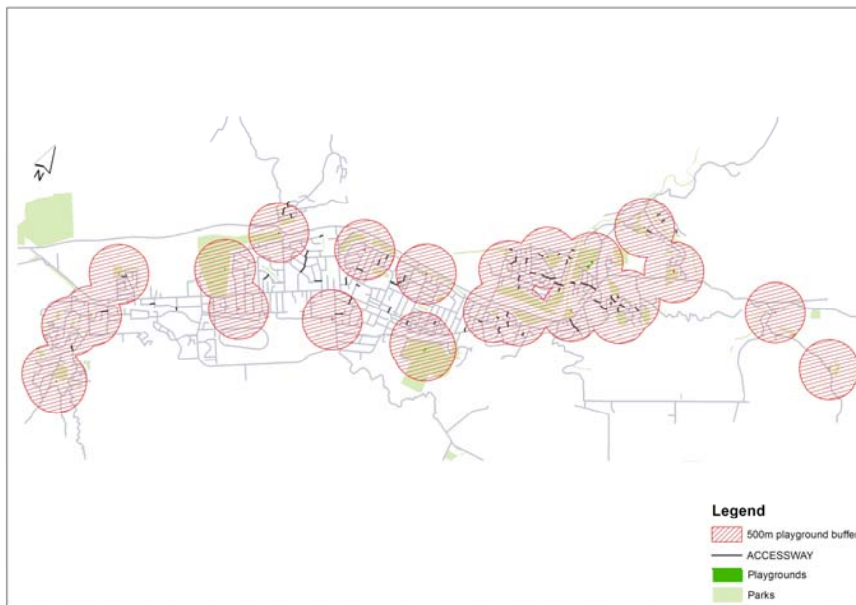
500 Metres Around Playgrounds

Those areas of the city that have been developed from the 1960s to 2000 are endowed with excellent access to neighbourhood parks with playground facilities. Within the older central valley core there is noticeably less accessibility to such parks. Local primary schools [i.e. St Brendans, Trentham, Fraser Crescent, Upper Hutt Central and Oxford Crescent] may be providing for local demands for play facilities, but this relationship has never been formalised with Council.