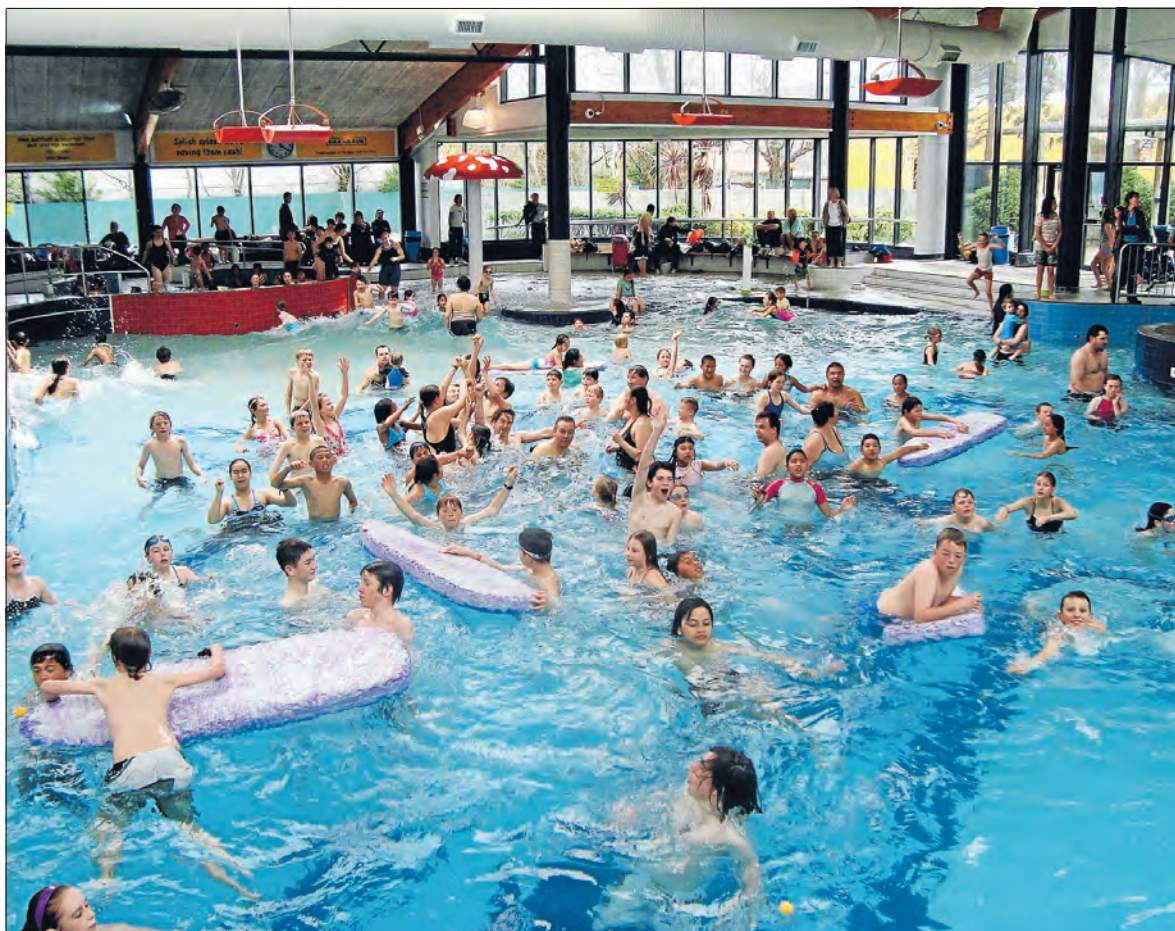
Summer joy: Upper Hutt's H2O Xtream pool complex has three slides, lane and wave pool, sauna, steam room and a poolside spa.

The Civic Centre is also home to the H2O Xtream pool complex with three large slides, lane and