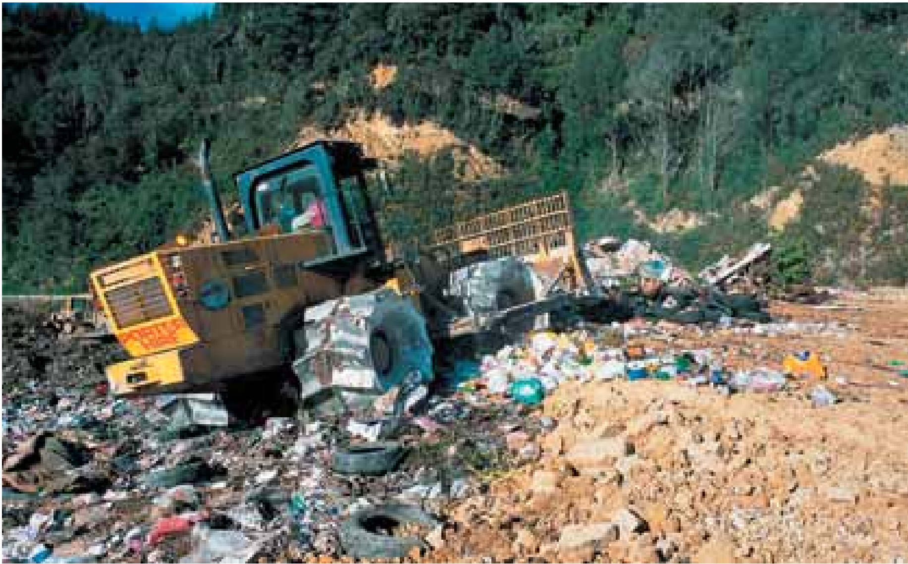
Compacting waste at the landfill working face